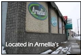
Located in Arnellia's

Plan Your Next Business Meeting, Training Session or Event at Abundant Bistro